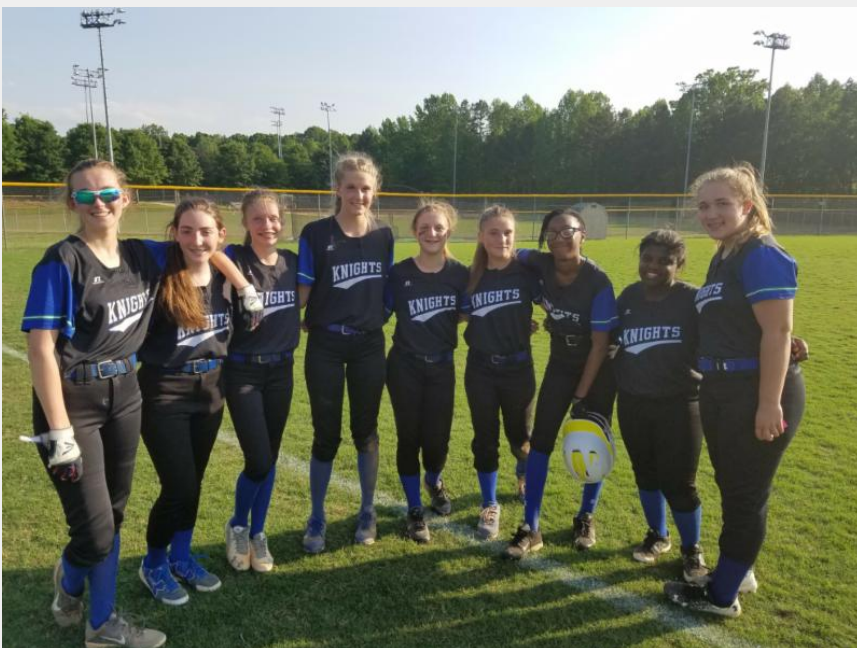
8th grade MS softball players after their final MS game celebrating their undefeated season!