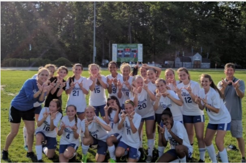
Congratulations to MS soccer, 2017 Conference Champions!