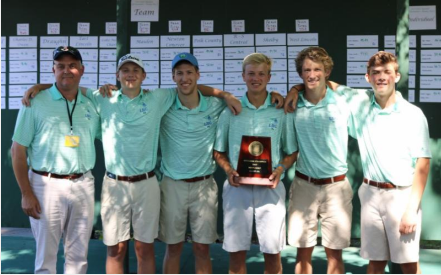
HS golf finished their season unbeaten in league play and won the conference championship!